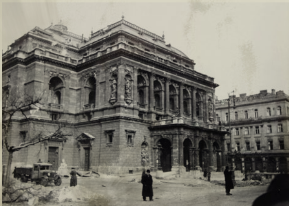
THE OPERA HOUSE IN 1945