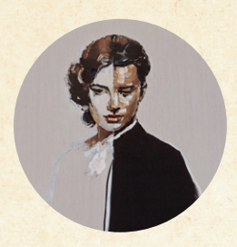
Ludwig van Beethoven FIDELIO